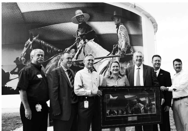
707 Brentwood Dr., Baytown, TX 77520