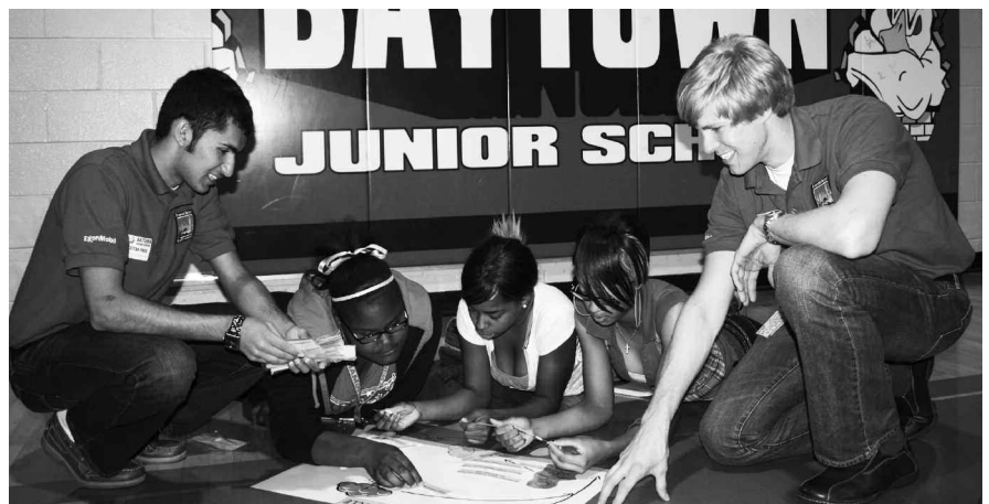
ExxonMobil employees help Baytown Junior High School students prepare for their TAKS test.