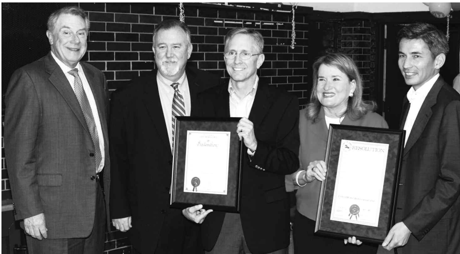
1901 Dorris St., Baytown, TX 77520