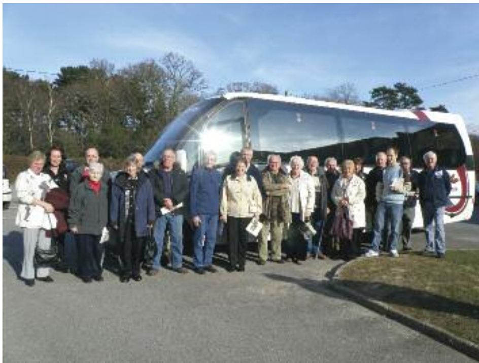
Guests on the community tour