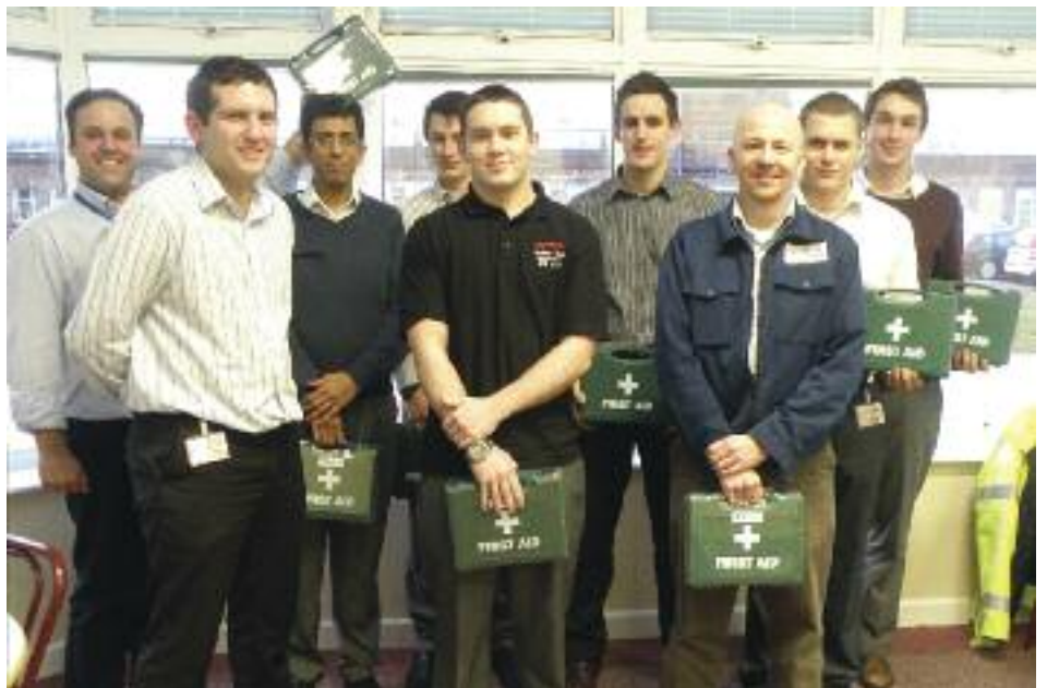
Employees with their first aid kits

Employees at Fawley took part in free first aid courses run by St John Ambulance towards the end of last year.