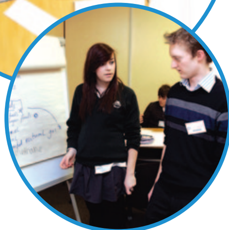
Surrey students from Therfield School (above) and St Andrew's School (left) take part in the National Sci-Tech Challenge