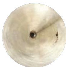
Mobil DTE 10 Excel Series 2,500 hours

Mobil DTE 10 Excel Series oils outlast conventional hydraulic fluids by up to 3X*