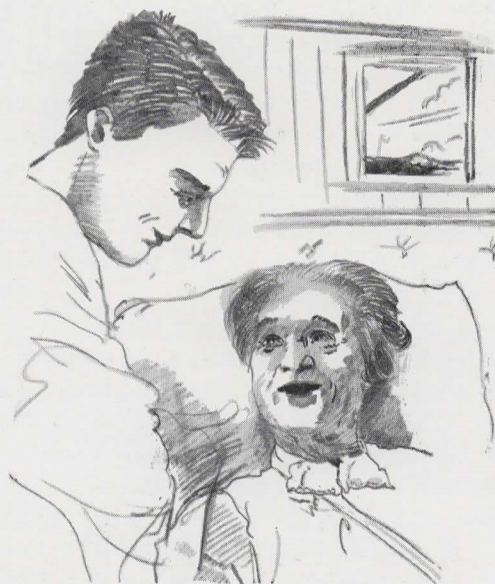
Her son was among the Mermaid's survivors.

The workings of fate are indeed strange. Five related disasters without loss of life, even a miracle that saved a life! Was it fate? Was it destiny? Or was Father Neptune trying to make some amends for his frequently recalcitrant subject Davy Jones who must have been angry with the Mermaid and her crew who started it all.