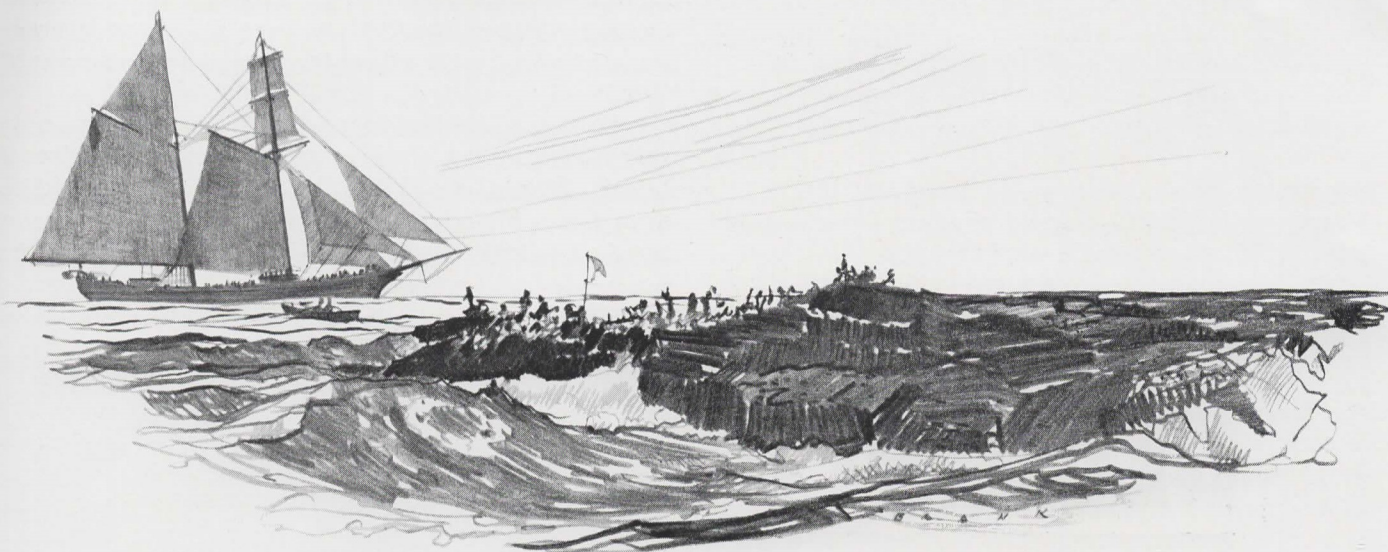
The City of Leeds sighted the 123 men clinging to some slippery rocks.

that clung to the rocks. Their trial ended the third day when the bark Swiftsure hove in sight and picked them up. Or did it end?